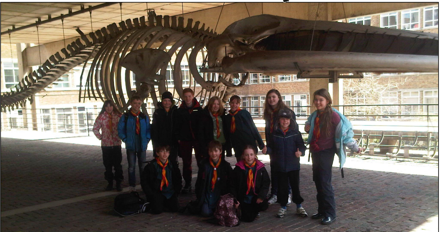
Having a whale of a time beneath a finback whale

The Museum of Zoology is a very interesting place to visit, and the Young Zoologists Club have produced a number of word-searches and a trail that make it great, informative fun for the children!