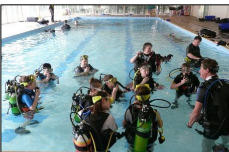
Kit on and time for some in water briefing before going underwater

Dive Machine of Tonbridge are a great team of people who really ensure the safety of the divers and are very patient with those