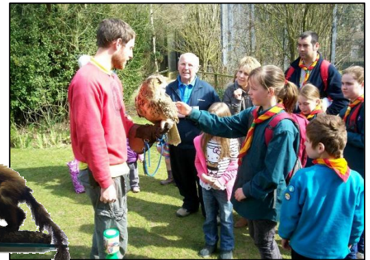
Eagle Owl encounter: Linton Zoo

The Museum of Zoology is a very interesting place to visit, and the Young Zoologists Club have produced a number of word-searches and a trail that make it great, informative fun for the children!