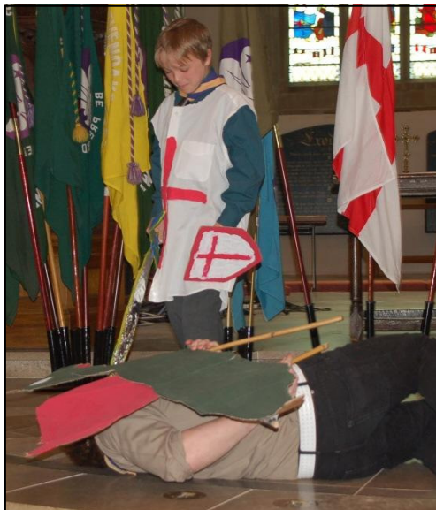
Slain: The story of St George is played out