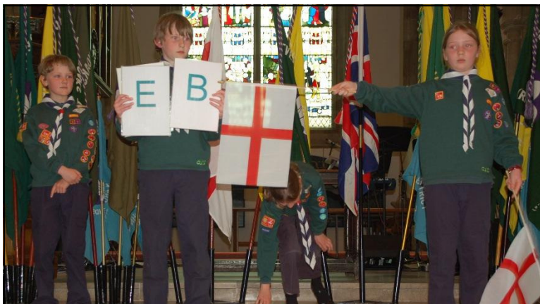
A message to you...