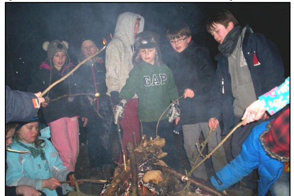
Marshmallows, sausages & strawberries

Visiting the Museum of Zoology... Q: So what can you tell me about this fellow? A: He's very extinct!