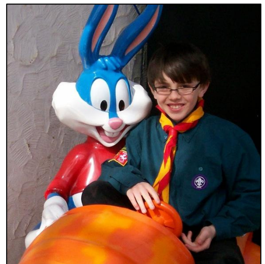
A young zoologist!