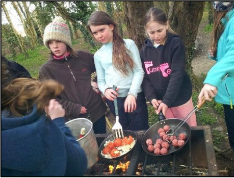
Our cooking competition