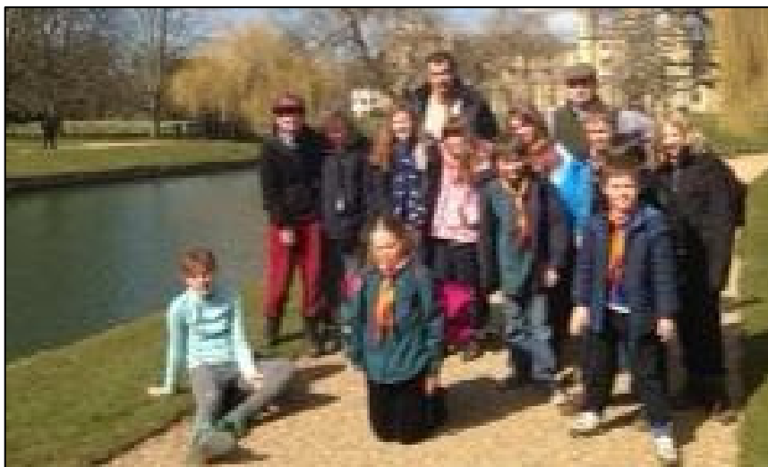
Scouts in Cambridge