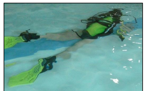
Within about 5 minutes of being in the water the Scouts try out their new skills

with Scouts then we have had quite a few dads coming along as well as the group chairman!